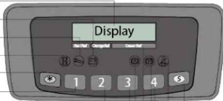
ZAPI standard type meter (for GC2R model)

The reliable special instrument gives a complete display of the vital information, like operation status, fault detection, etc. It ensures the operator predominate the vehicle status more intuitive and convenient.