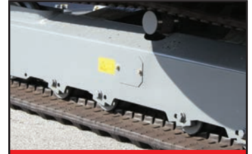
Triple Flanged Track Rollers

Ease of transport and an excellent working range make the TB235-2 a great choice for owner-operators, rental companies, utilities and general contractors. The TB235-2 has all steel construction, a spacious operator station available with air conditioned cab (optional), an automotive styled interior, outstanding multi-function operation, LED light package (optional) and cushioned boom and swing cylinders for enhanced performance comfort and durability. The TB235-2 has the latest