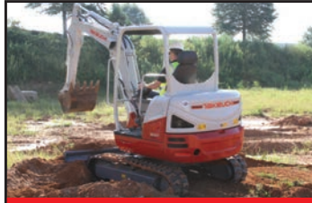
All Steel Construction