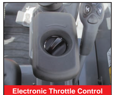
Electronic Throttle Control