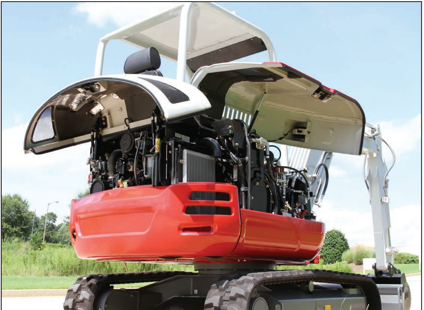
Lockable service hoods lift overhead for outstanding maintenance access.

emission standards compliant engine that has no DPF for low maintenance operation. Additional features include an automatic fuel bleed system, double element air filters (optional), large wrap around counterweight, and exceptional serviceability due to the engine and side hood that open overhead for greater convenience. The operator is protected by ROPS/TOPS/OPG (TOP Guard, Level I) cab or canopy for greater peace of mind and comfort.