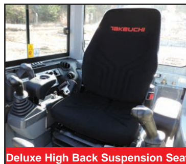
Deluxe High Back Suspension Seat