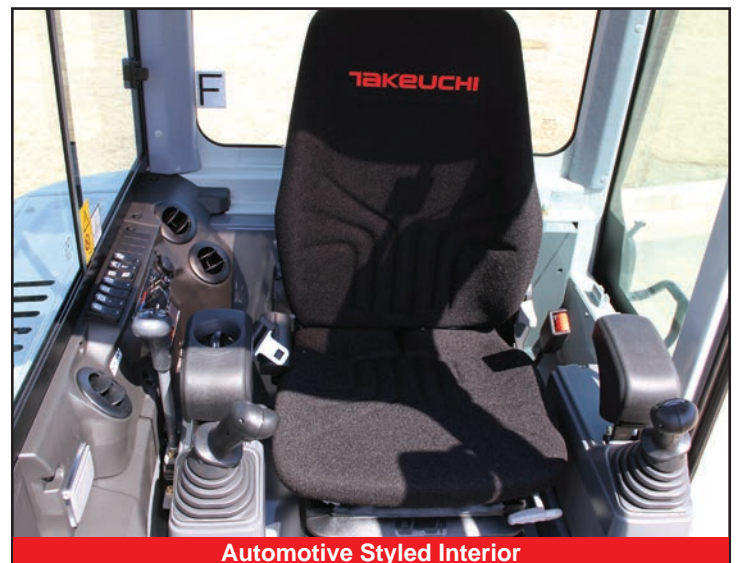
Automotive Styled Interior

*Functions may not be available in all countries, so please consult your Takeuchi dealer for details.